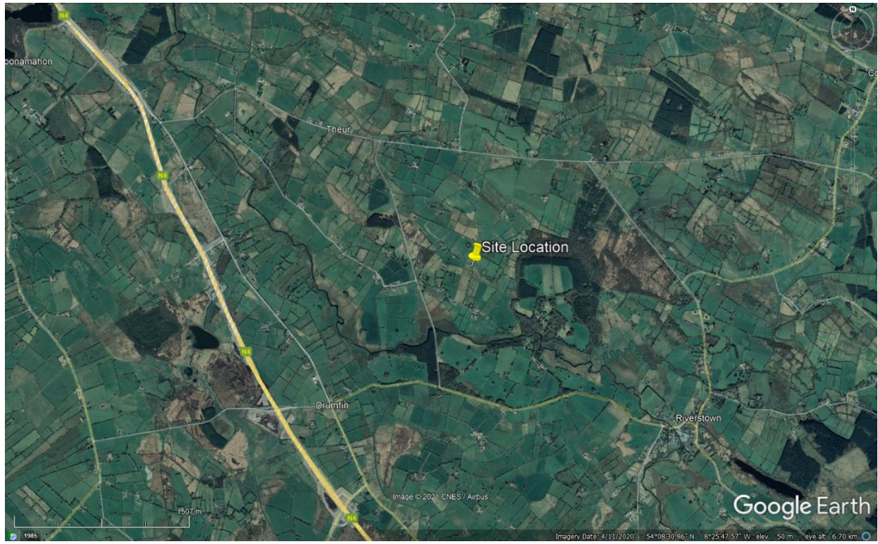
Fig. 1. Location of the construction site at Lisbanagher, Co. Sligo