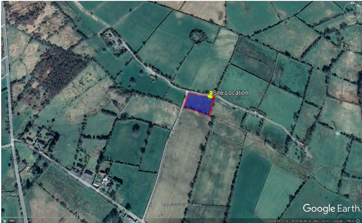
Fig. 2. Aerial image of proposed site in blue

The project involves the construction of a new dwelling house with a waste water treatment system and associated site works at Lisbanagher, County Sligo (Coordinates: 54° 8'32.40"N, 8°25'32.40"W) (see Figure 1 for site location, Figure 2 for local site location).